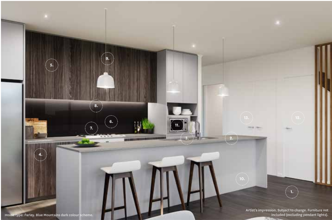
House type: Farley. Blue Mountains dark colour scheme.

Artist's impression. Subject to change. Furniture not included (excluding pendant lights).