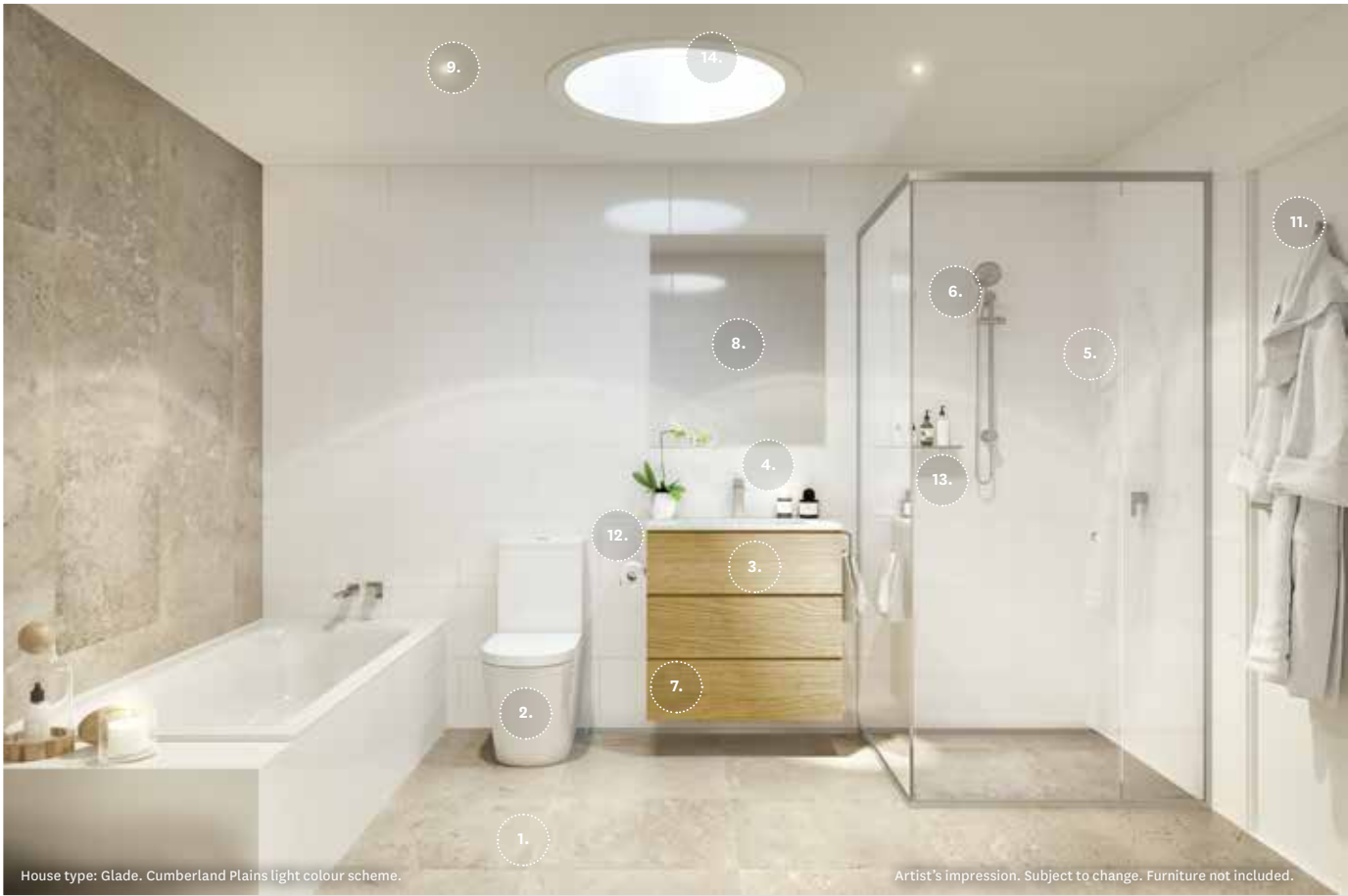
House type: Glade. Cumberland Plains light colour scheme.

Artist's impression. Subject to change. Furniture not included.